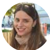
Maria Joao PIRES