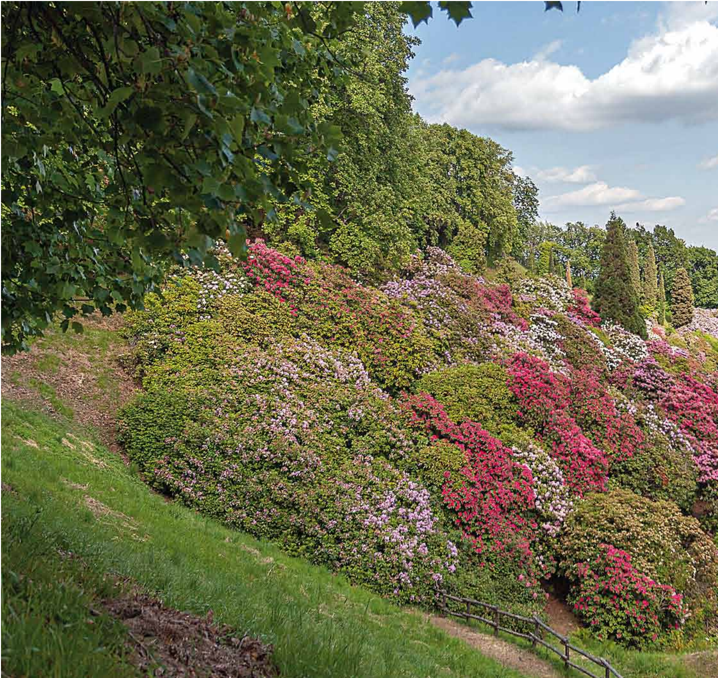
View of Burcina